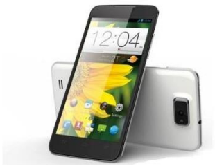
ZTE Grand Memo