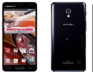
LG Optimus G Pro